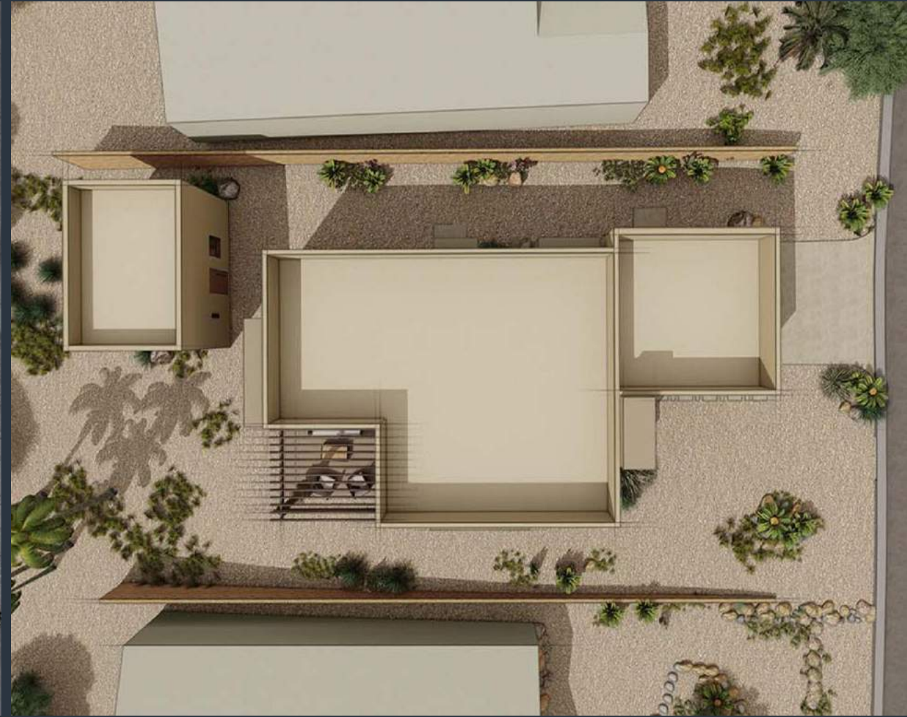
Verbena Opportunity Birds Eye View