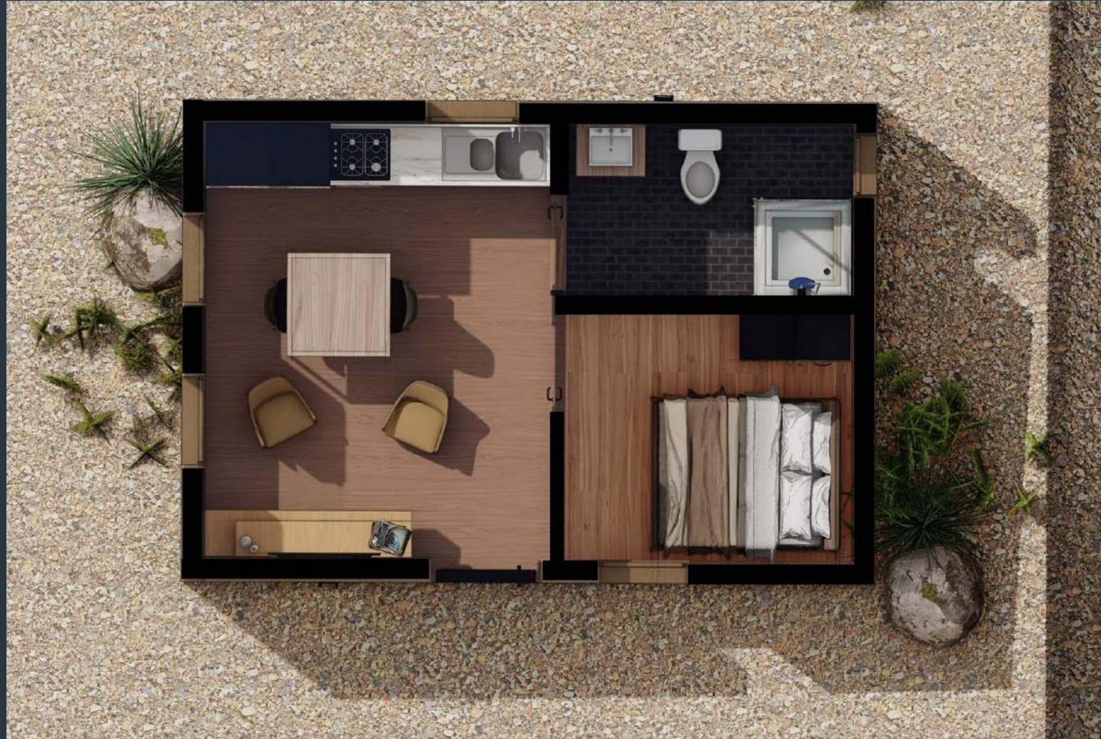
Interior Birds Eye View