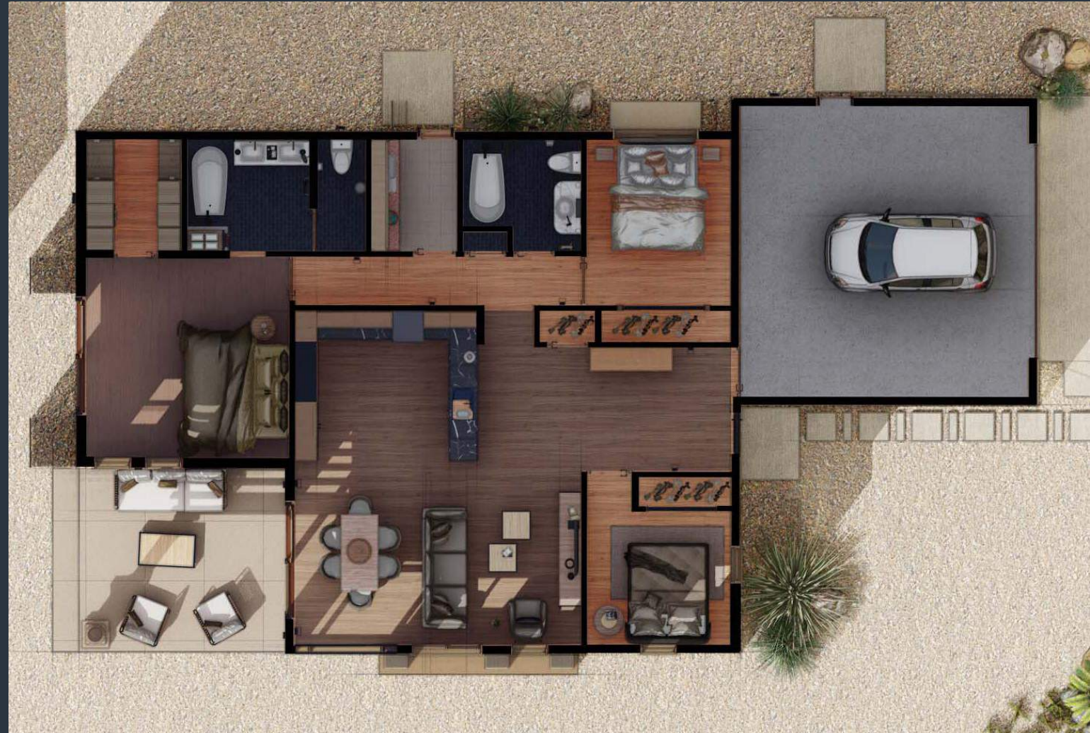
Interior Birds Eye View