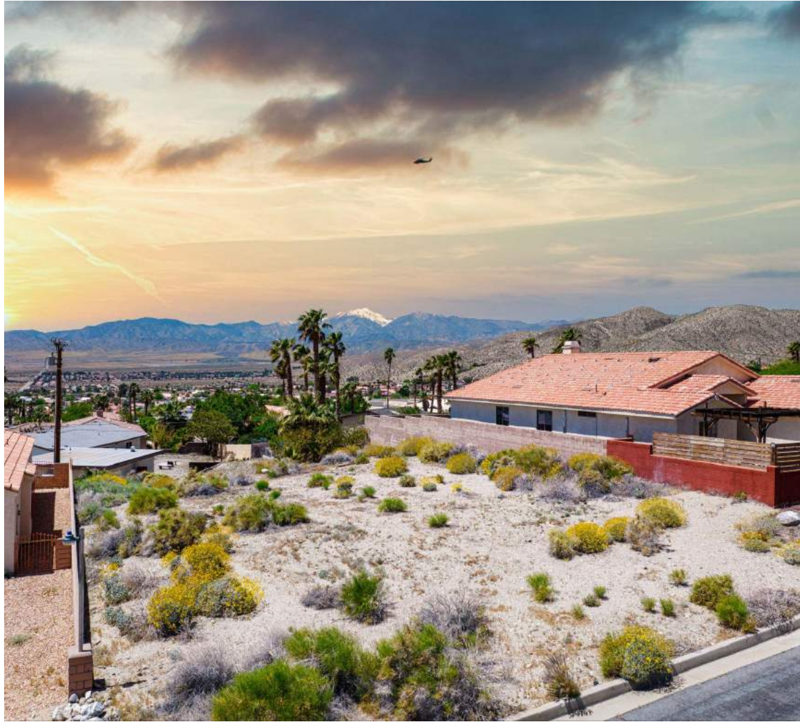
Premium Lot View